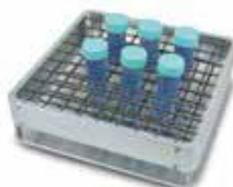
Universal platform with springs PW-260