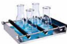
Universal platform with adjustable bars UP-12