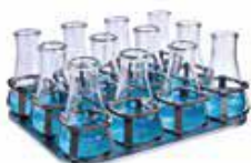
Platform with clamps P12-100