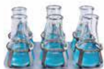
Platform with clamps P6-250