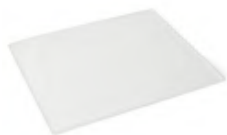
Sticky Pad SPD-GS used in the platform PP-4 or PP-4A