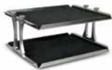
Double deck flat platform with non-slip rubber mat PP-4A