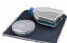
Flat platform with non-slip rubber mat PP-4