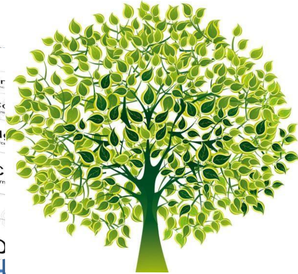
Negative Ions Fiber