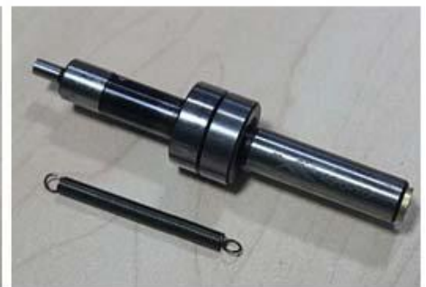
Antimagnetic edge finder