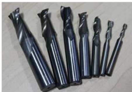
Fluts Hss end mill