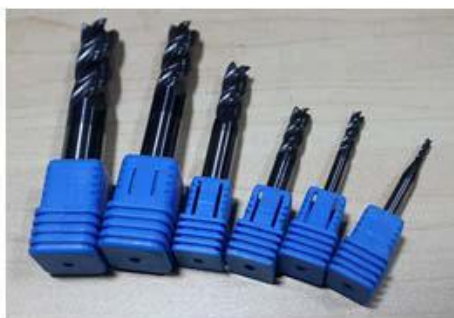
Carbide end mill 5 pieces set