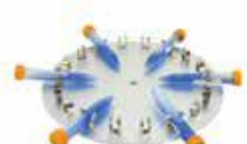
YC-B platform: Conical tube 15mlX18