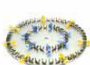
YC-C platform: 1.5ml centrifuge tubeX64