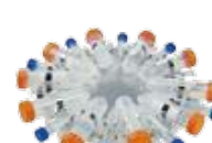
YC-E platform: 50ml centrifuge tubeX10 15ml centrifuge tubeX10 1.5ml centrifuge tubeX30