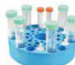
YC-D Foam tube holder: 50ml centrifuge tubeX12 15ml centrifuge tubeX12 1.5ml centrifuge tubeX30